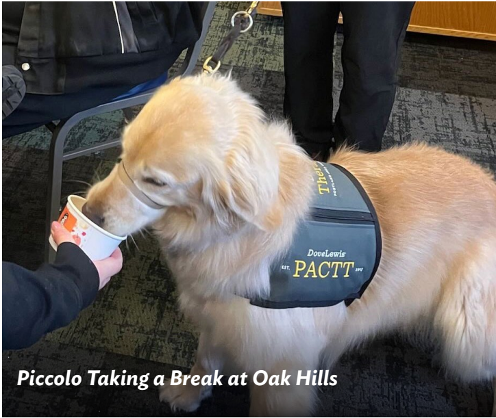
Piccolo Taking a Break at Oak Hills