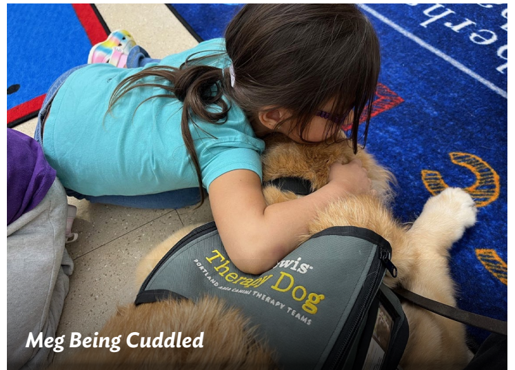
Meg Being Cuddled