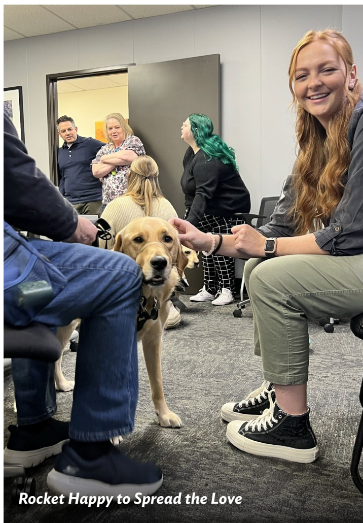
Rocket Happy to Spread the Love