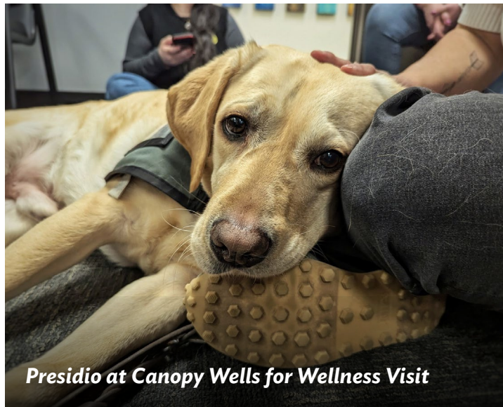
Presidio at Canopy Wells for Wellness Visit