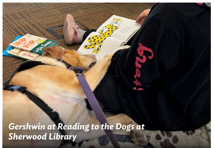
Gershwin at Reading to the Dogs at Sherwood Library