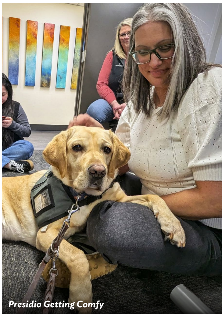
Presidio Getting Comfy