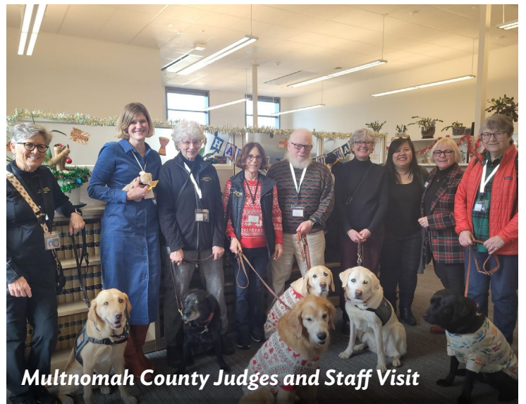
Multnomah County Judges and Staff Visit