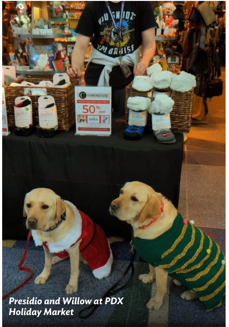
Presidio and Willow at PDX Holiday Market