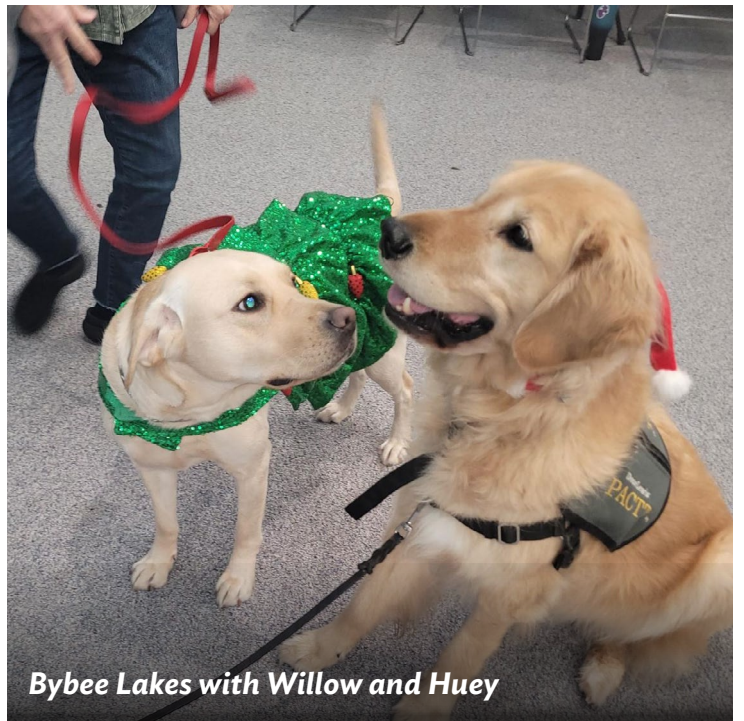
Bybee Lakes with Willow and Huey