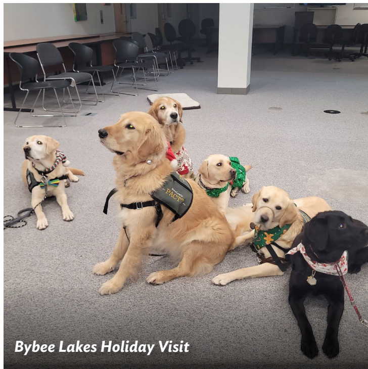
Bybee Lakes Holiday Visit