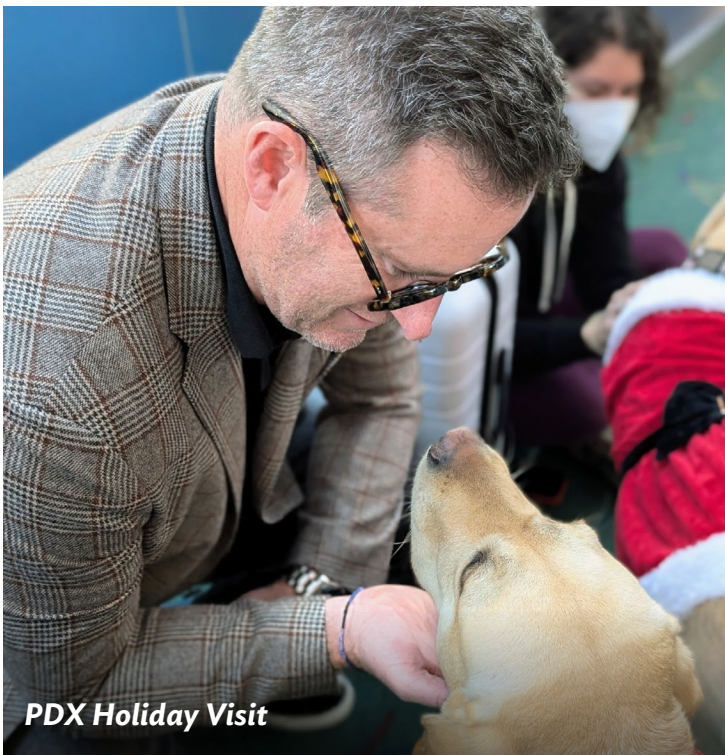
PDX Holiday Visit