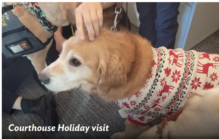
Courthouse Holiday visit