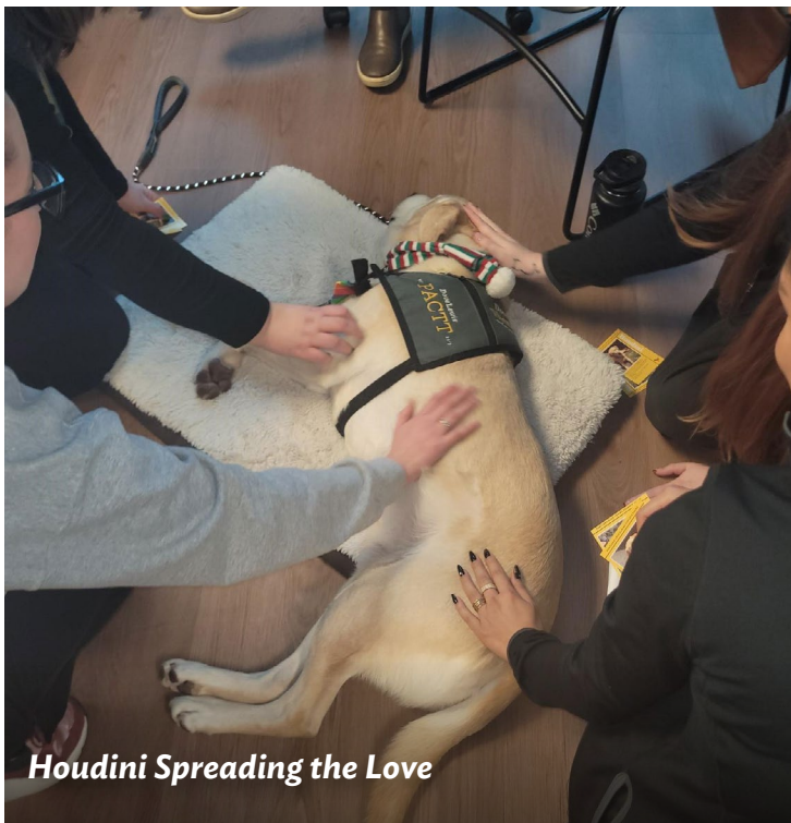
Houdini Spreading the Love