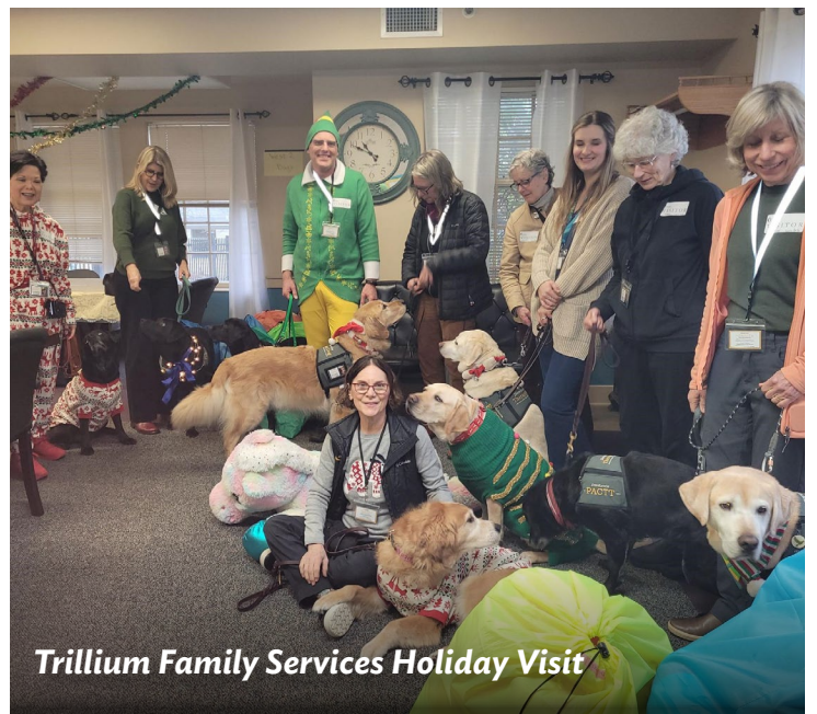
Trillium Family Services Holiday Visit