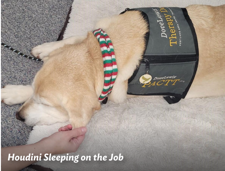
Houdini Sleeping on the Job