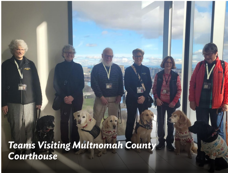
Teams Visiting Multnomah County Courthouse