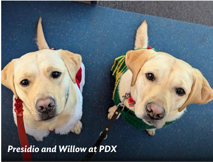
Presidio and Willow at PDX