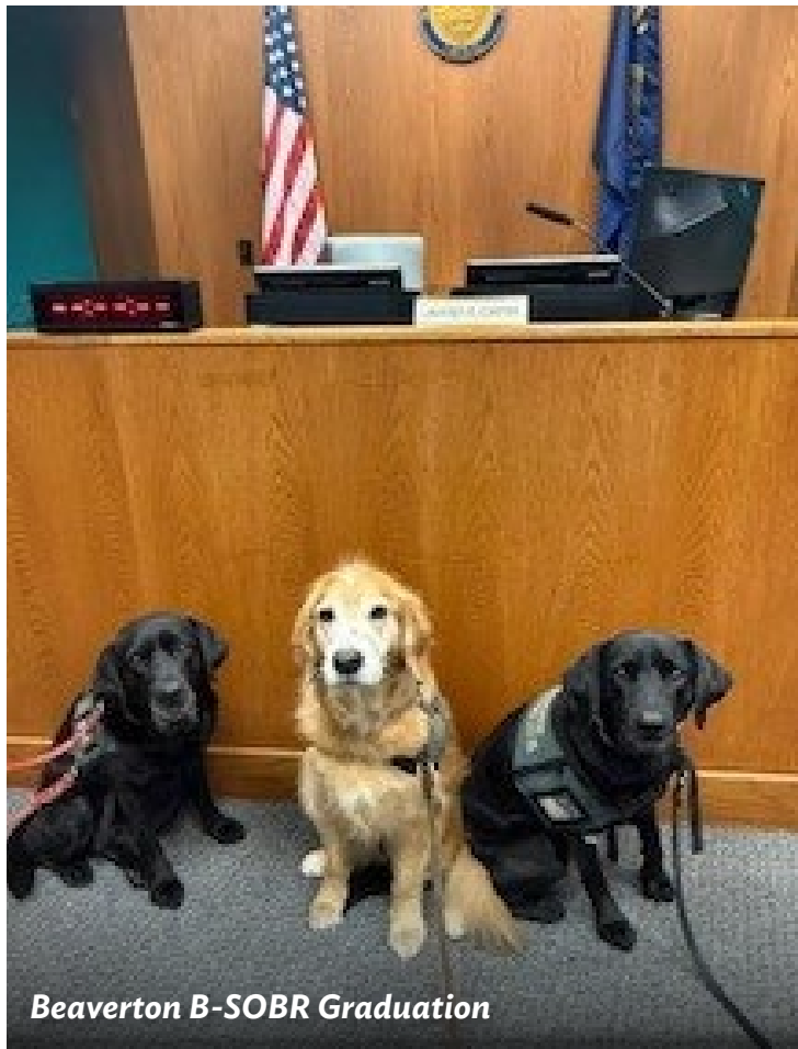
Beaverton B-SOBR Graduation