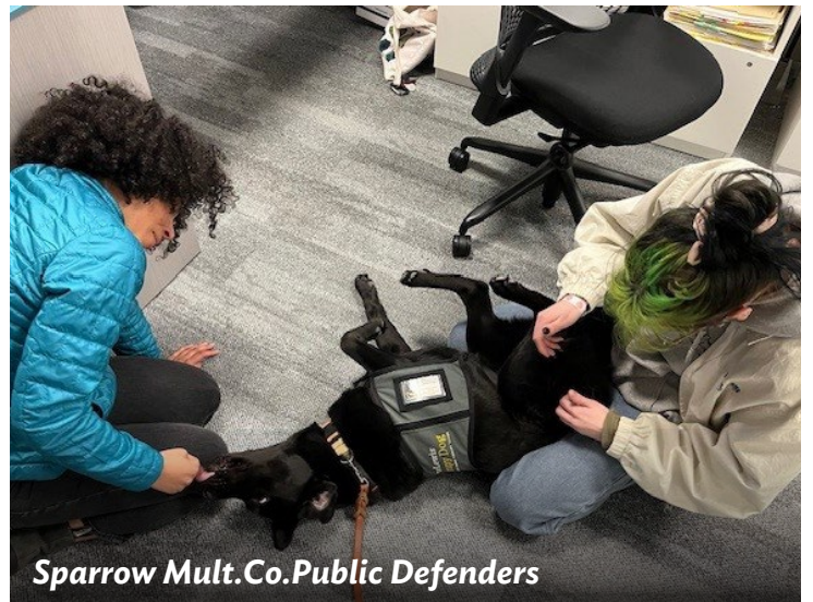
Sparrow Mult.Co.Public Defenders