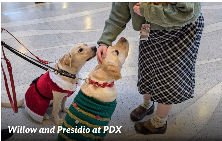
Willow and Presidio at PDX