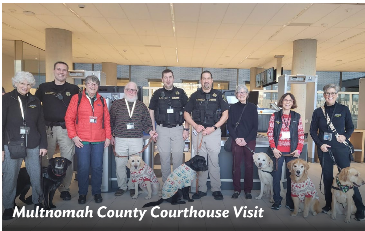
Multnomah County Courthouse Visit