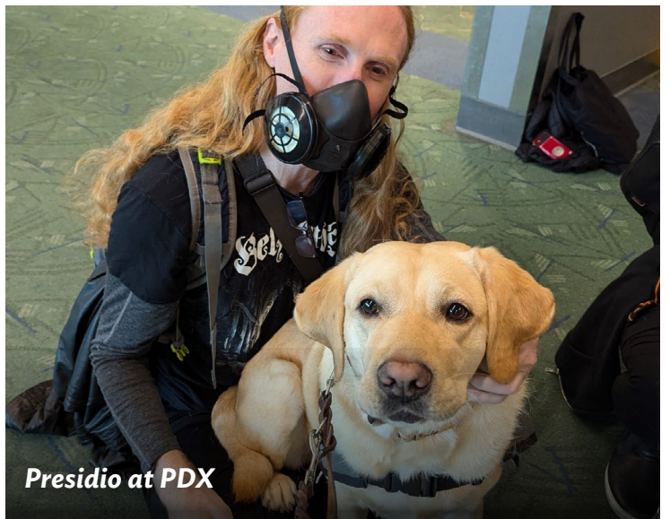
Presidio at PDX