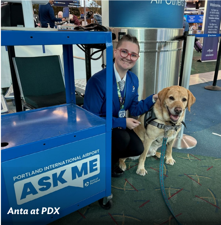
Anta at PDX