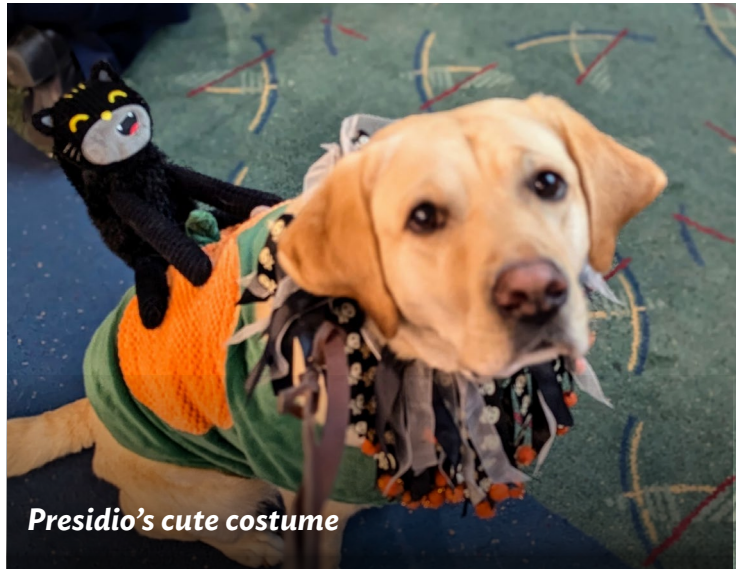
Presidio's cute costume