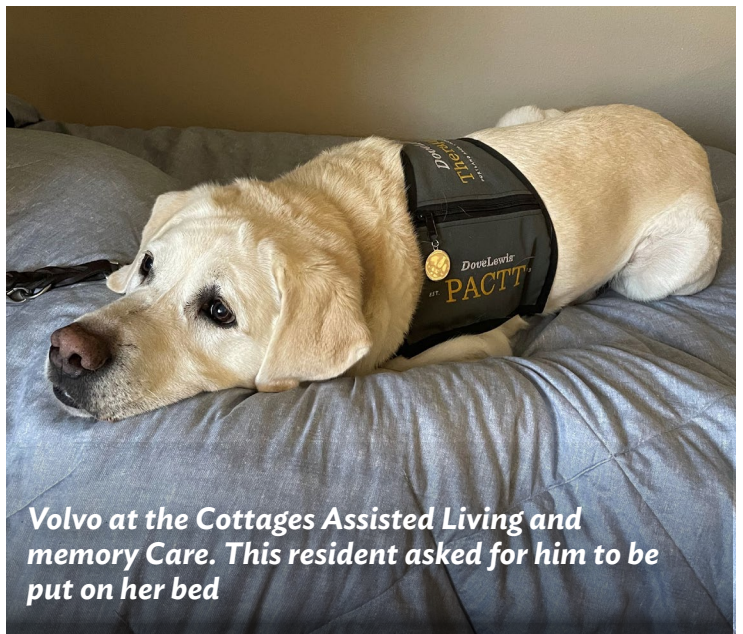
Volvo at the Cottages Assisted Living and memory Care. This resident asked for him to be put on her bed