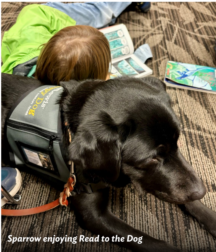
Sparrow enjoying Read to the Dog