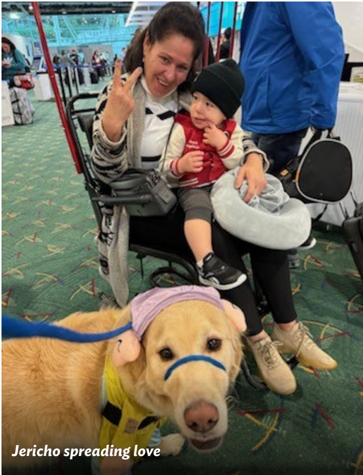
Jericho spreading love